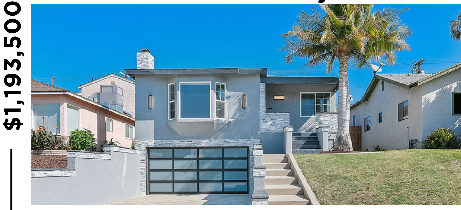
3931 W 58th Place, Los Angeles, CA 90043

West Los Angeles Modern home just hit the market! This updated home features 3 bedrooms, 2 bathrooms and 1,884 sq ft of living space. The home features a family room with custom fireplace tiles, recessed lighting and a large slider that leads to the entertainer's backyard. Yard features a large deck for entertaining and a grassy area. The kitchen boasts white shaker cabinets, an open concept layout to include the light and bright dining area island and modern appliances. To finish off this amazing home, there is a wonderful primary bedroom with en-suite bathroom that includes a modern tiled shower and whirlpool tub. The guest bedrooms are a great addition to this wonderful layout! Each bedroom includes ceiling fans and mirrored closet doors. Guest bathroom has also been updated, remaining consistent to the modern style with glass slider and extra storage. Located close to local shops and easy access to major roads and freeways! Come by and take a look at this stunning home!