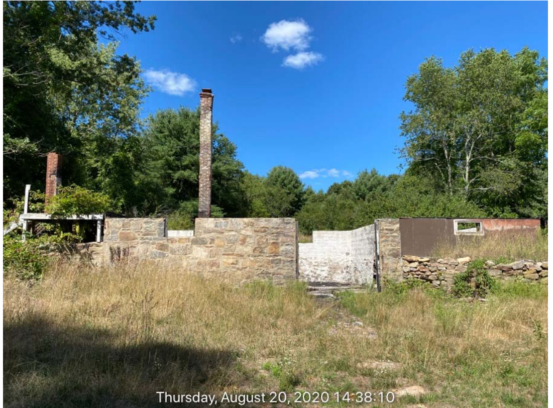
Thursday, August 20, 2020 14:38:10

Located in the Greene Section of Coventry.