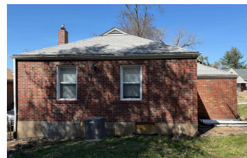
BACK OF HOUSE